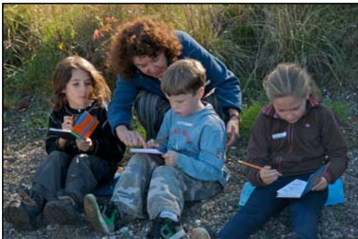
A SSI Conservancy volunteer teaching kids about marine creatures

To support the Women's Empowerment Group, which helps women overcome addiction and take charge of their lives