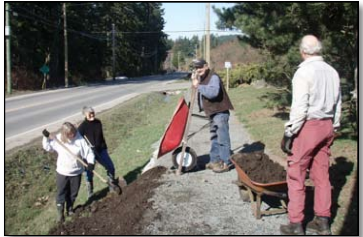
A volunteer crew from Island Pathways hard at work

Two grants—one to assist with the costs of a series of sexual health and healthy relationships workshops and the other to help with costs for workshops for Grades 7 to 10 students in SWOVA's Respectful Relationships Program